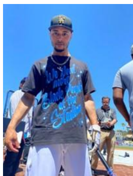
Mookie Betts, Dodgers Right Fielder

The one clothing piece that never gets out of trend is the 't-shirt'. Whether it's a graphic tee, plain oversized t-shirt, or body-hugging t-shirt, they have always ruled the trend and are liked by people of all age groups. Perhaps you've seen that a celebrity or athlete like the Dodgers' Mookie Betts, wearing one to spread a social message or to set a trend.